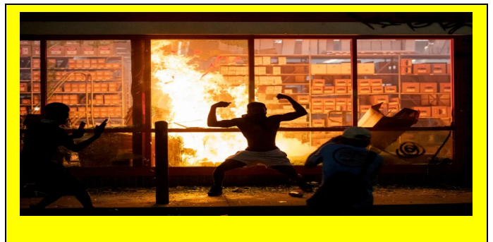
Rioters in Minnesota pose for a photo op.

instruct us in the way of truth and righteousness. The law of God is good ( 1 Timothy 1:8 ) and perfect ( Psalm 19:7 ). The Bible clearly states that God’s law “is not made for a righteous man, but for the lawless and disobedient, for the ungodly and for sinners ...” ( 1 Timothy 1:9 ). The law of God in the Bible is eternal and unchanging. It comes from the mouth of God, Who is eternal, perfect, just, and unchanging. Therefore, the moral standards presented in the law of God are for all people in all cultures throughout all the ages. When any person measures his spiritual standing in light of this perfect standard, he realizes that he is a sinner, and in need of God’s power to be saved and change.