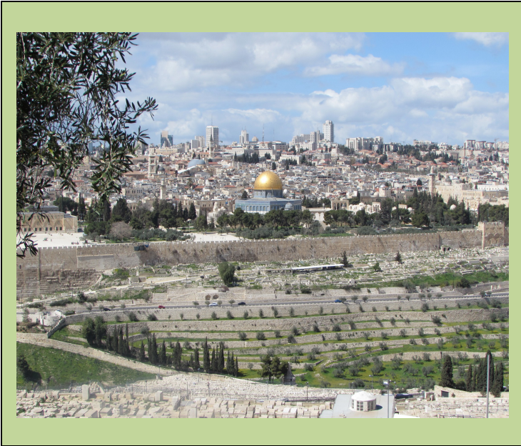
Jesus will rule the world from Jerusalem, Israel.

Temple Mount in Jerusalem] ” ( Psalm 2:6 ). Jesus will rule over the nations of the world from Jerusalem. Before this happens, the devil will be cast into the fiery bottomless pit for 1,000 years. He will be confined so that he cannot continue to “deceive the nations” ( Revelation 20:3 ).